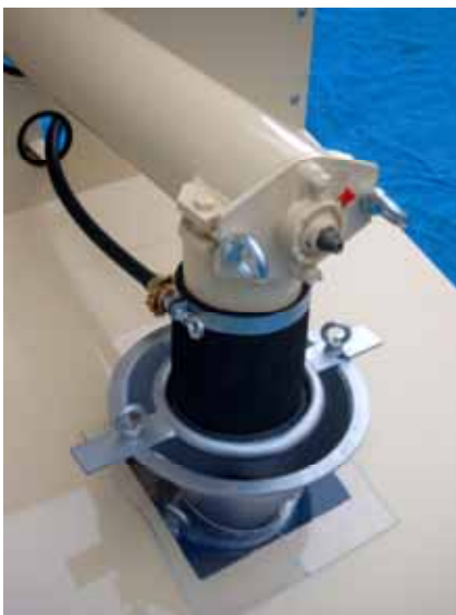
View to the mixing cone with water torus